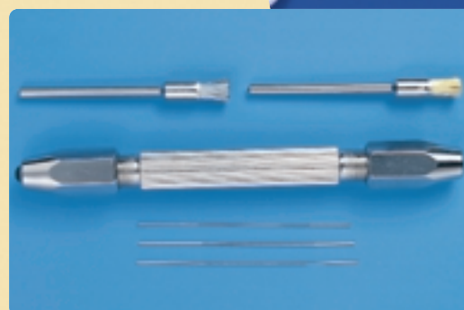
FID Cleaning Kit